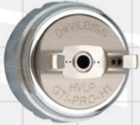
No H1 HVLP Air Cap