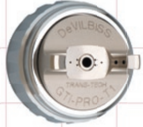
No T1 Trans-Tech Air Cap