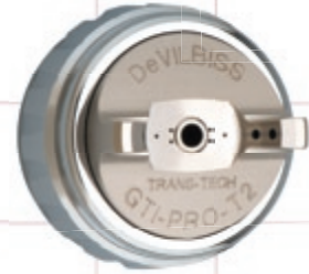
No T2 Trans-Tech Air Cap